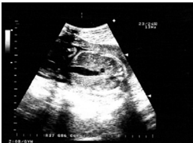
Fig 1. Transabdominal ultrasound shows the increased diameter of the affected umbilical vein.