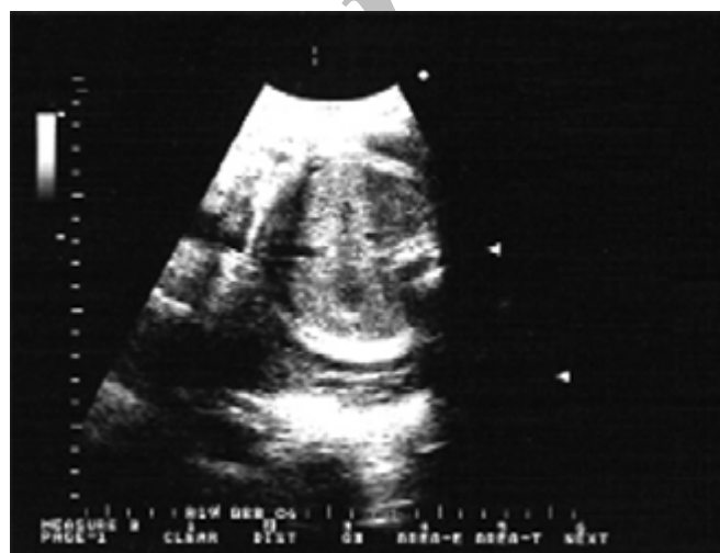
Fig 5. Transverse view of the fetal abdomen at 22 weeks' gestation.