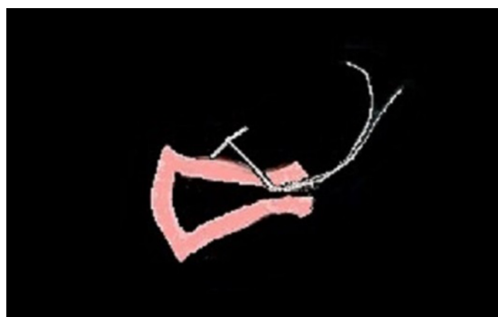
Figure 3. Schematic View of IUD Displacement